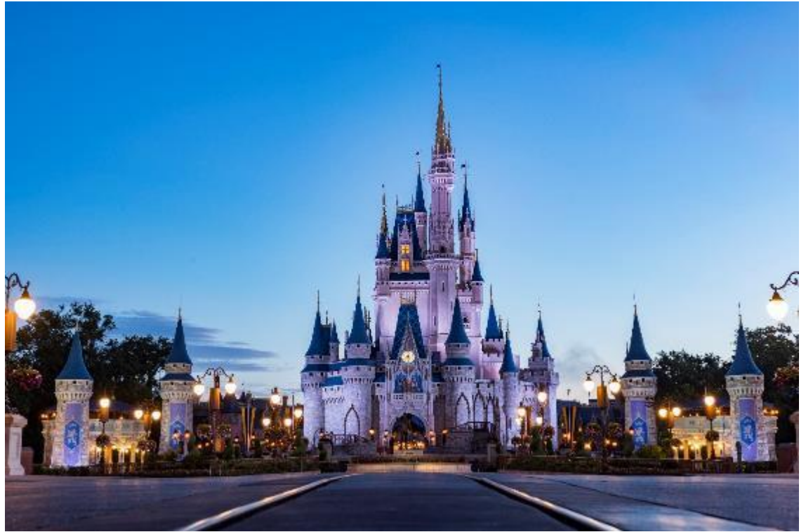
As to Disney properties/artwork: ©Disney